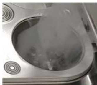
CC-9 w/ 50% H 2 O 2