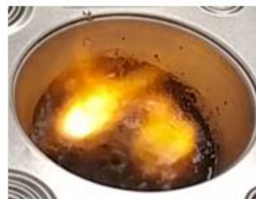
MnO 2 w/ CMP-X