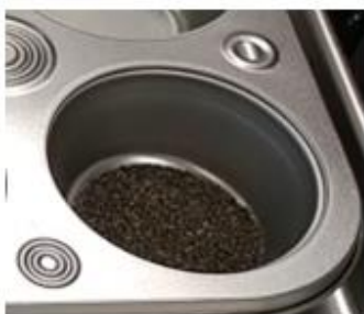
CC-9 in tray

An MPUC system equipped with CMT technology is an exceptionally compact, moderate thrust, lightweight system with very high volumetric impulse. This system offers affordable access to CubeSat propulsion and is easily scalable to larger sizes depending on mission requirements to meet needs of differing users in DOD, industry, and academia.