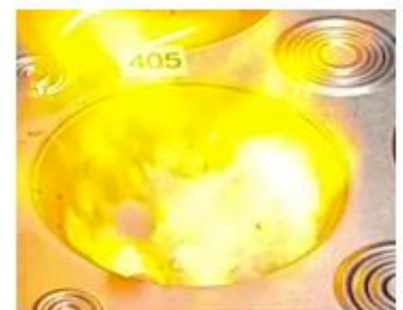
CC-9 w/ CMP-X

CUA | 3001 NEWMARK DRIVE | CHAMPAIGN, IL 61822